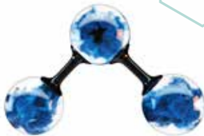
molecule of Ozone